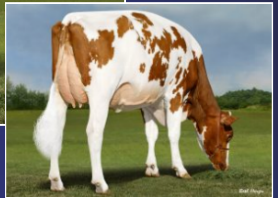
Spunky P Red